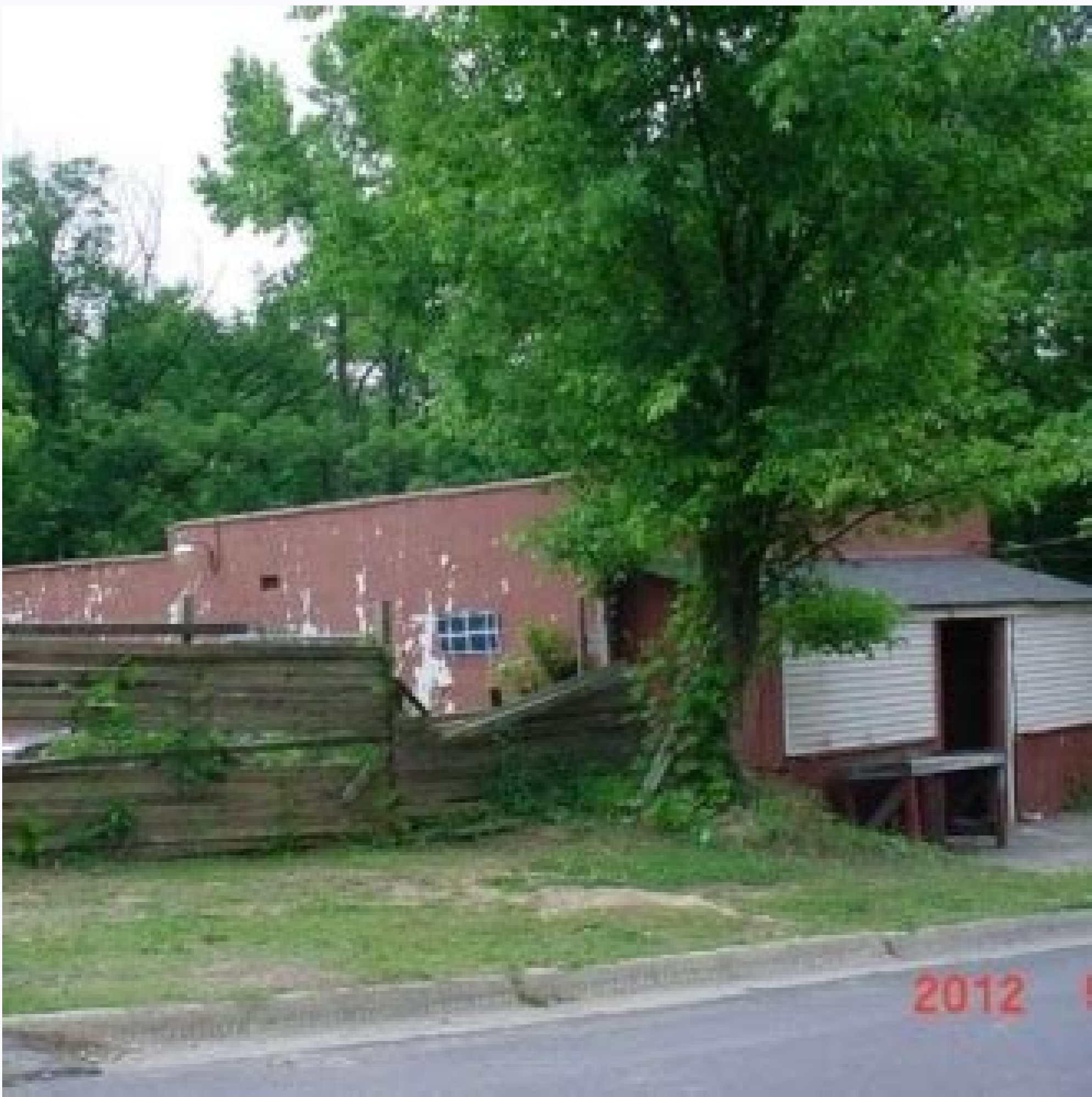
808 bacon street durham nc 27703.